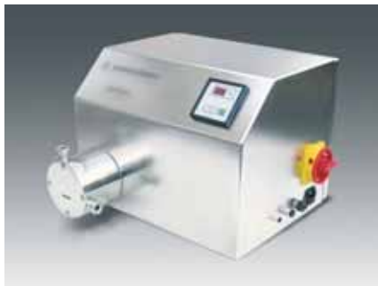
SartoJet four piston diaphragm pump

The pump design is especially suited for: