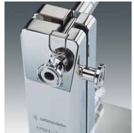
Sartoco ® Slice Filter holder